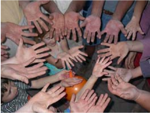
The hands of the Volunteers who planted our Vineyard

We believe that to make great wine, we must take just as much responsibility for the lands we steward as the community we live in. We feel strongly that growing grapes, making wine and raising a glass is a cultural ritual that fosters friendship, brings together families, and unites communities.